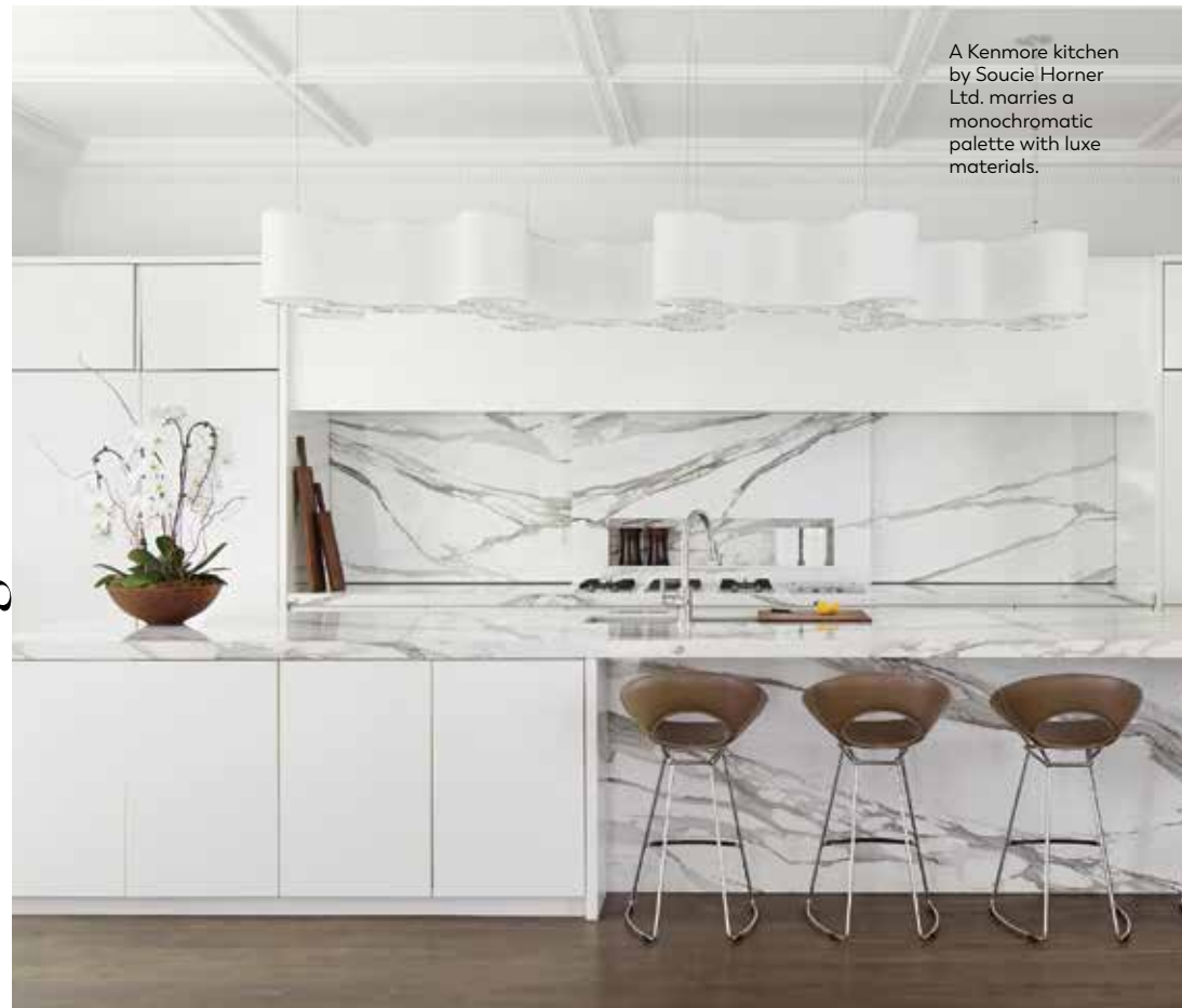
A Kenmore kitchen by Soucie Horner Ltd. marries a monochromatic palette with luxe materials.

has graced modern-bent lakefront retreats, posh pieds-à-terre and commercial locales. 110 W. Kinzie St., 4th Floor, kadlecdesign.com