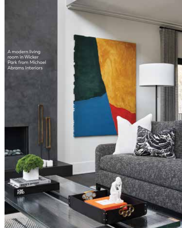
A modern living room in Wicker Park from Michael Abrams Interiors